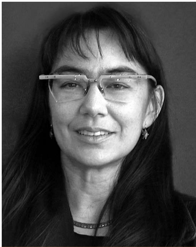
Travels of Mariko Horo: Last Judgment Tamiko Thiel, 2006

As Italo Calvino’s book Invisible Cities used Marco Polo as the point of departure for a meditation on the meaning of cities, I use the figure of Mariko Horo as a point of departure for a meditation on the Mythic West. Her journey is of course an inversion of the “Marco Polo Syndrome.” The 13th century Venetian traveler has long represented the exoticizing gaze that looks from Europe into the depths of Asia, a symbol of Western Man exploring, categorizing and analyzing the exotic cultures of the East. The exoticizing gaze thinks itself to be a magnifying glass, but in actuality it is a view through a half-silvered mirror: the viewer means to describe new lands, new peoples, new cultures, but in reality he sees images of his own culture superimposed over a vague and exotic background. I wish to reverse this gaze, invert the mirror and view the exotic West through Mariko’s fictitious but observant eyes. E3